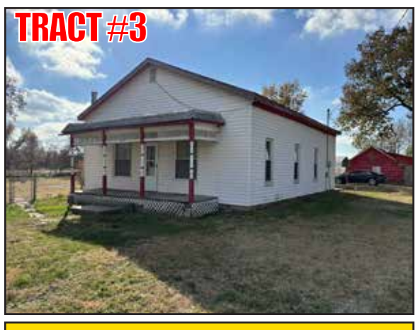
TRACT #3 OPEN HOUSE Sunday, 11/26/2023 from 2-3pm

TERMS: Earnest money due day of the auction will be $5,000.00 (Tract #1), $1,500 (Tract #2), $2,000 (Tract #3) made payable to Security 1st Title. The balance will be due in full at closing which shall be on or before Tuesday, January 21, 2024, at which time buyer will receive appropriate Deed. Title insurance and title company closing fees will be shared 50/50 between buyer and the seller. Taxes will be prorated to the date of closing. The buyer will receive full possession at time of closing. Seller's mineral rights will transfer to the buyer. All inspections must be done prior to the auction. The property is sold in "as is" condition, with no warranties or guarantees. Buyers must rely on their own knowledge or have inspections completed prior to the auction. All financing arrangements need to be made prior to the auction. Bidding is NOT subject to the following contingencies, including but not limited to financing, appraisal, or inspection. All information has been gathered from Marion Co sources and is deemed reliable but is not guaranteed. Boundary lines on maps, photos and videos are approximate and not survey accurate. All announcements made day of the auction take precedence over any advertisements.